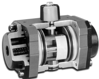
Pneumatic Actuator with Travel Indicator

Titan FCI offers a complete line of Pneumatic Actuators and Electric Actuators.