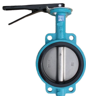
BF 75-CI 200 PSI Wafer Type Cast Iron Sizes: 2 ~ 12"