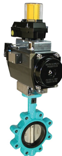
Pneumatic Actuator Mounting