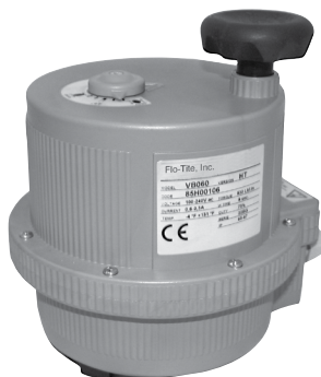
Electric Actuator for Sizes 3" & Smaller