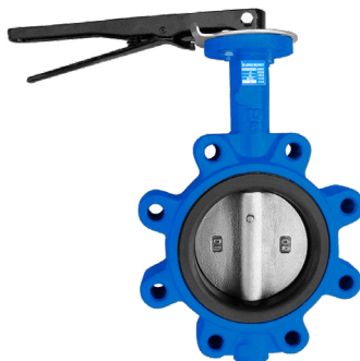
BF 76-DI 200 PSI Lug Type Ductile Iron Sizes: 2 ~ 12"