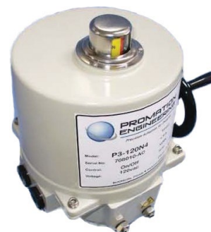
Electric Actuator for Sizes 4" & Larger