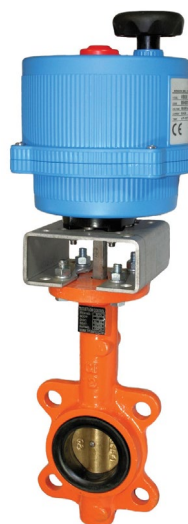
Electric Actuator Mounting