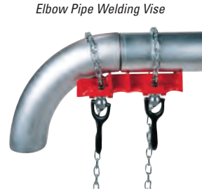
Elbow Pipe Welding Vise