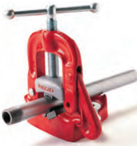
Bench Yoke Vise