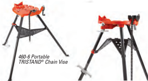
460-6 Portable TRISTAND® Chain Vise