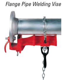
Flange Pipe Welding Vise