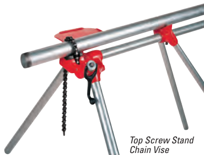
Top Screw Stand Chain Vise

*Jaw for Plastic Pipe, Catalog No. 41280 available; order separately