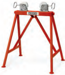
AR99 Adjustable Stand with Steel Rollers