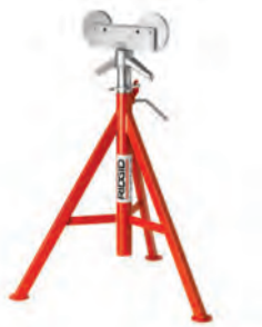
RJ-99 Roller Head High Pipe Stand