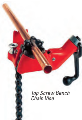
Top Screw Bench Chain Vise