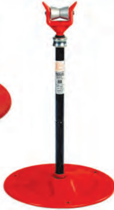
92 Adjustable Pipe Support