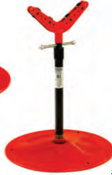
965 Support Stand for Groovers