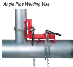
Angle Pipe Welding Vise