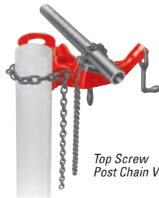
Top Screw Post Chain Vise