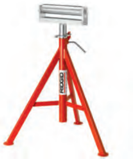
CJ99 Conveyor Head Pipe Stand