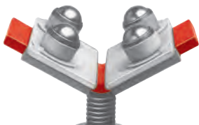
Ball Transfer Head