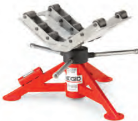
RJ624 Large Diameter Pipe Stand