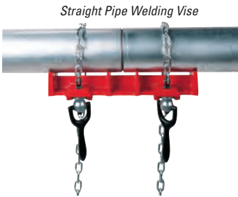
Straight Pipe Welding Vise