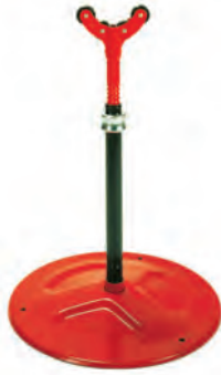
46 Adjustable Pipe Support

Ideal for use with threading machines, roll grooving, or other pipe working applications.