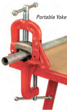
Portable Yoke Vise