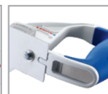
One Step Flush Cuttings