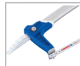
Stores up to 5 Blades in I-Frame