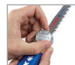
Loosen Knob to Change Blade