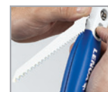
Rotate Blade Out