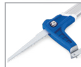
Use as a Jab Saw